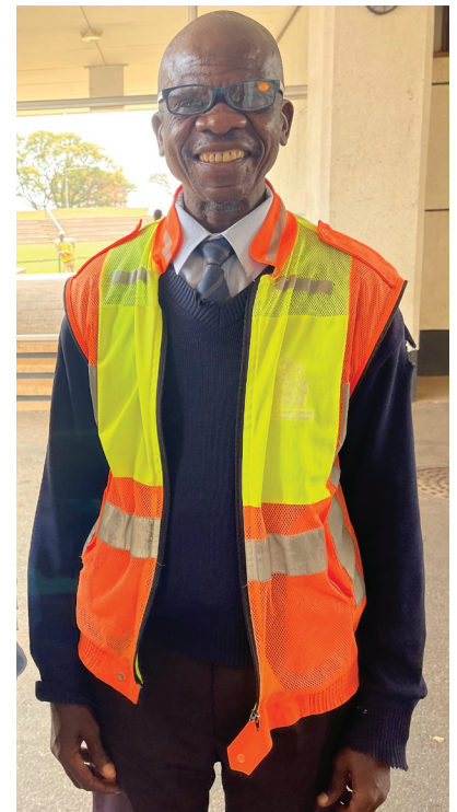
Airport worker - We noticed him squint to read our tickets so we gave him our last pair of glasses. His response, “Will these expire? I can see!”