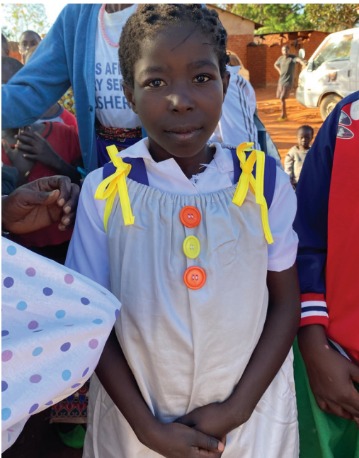
This girl from Mzimba Village is wearing her new dress.