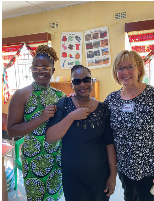
Trying on New Glasses