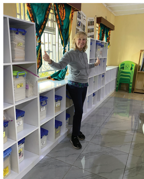
Look at all the shelves!!